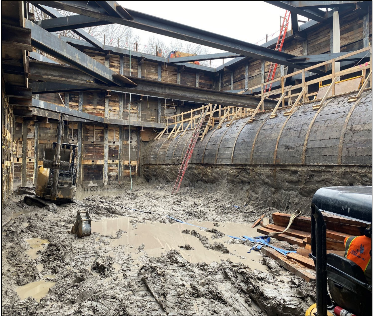
Figure 1 – North Side of Tunnel